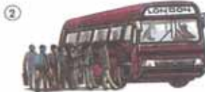
Starting an excursion

Excursions are made every afternoon (and sometimes for whole days) to London and other interesting places in the region.