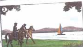
Horse-riding and sailing