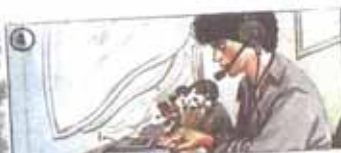
In the language laboratory